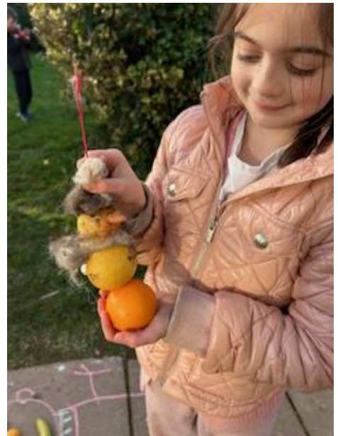
FACES IN THE STYLE OF THE ARTIST GIUSEPPE ARCIMBOLDO